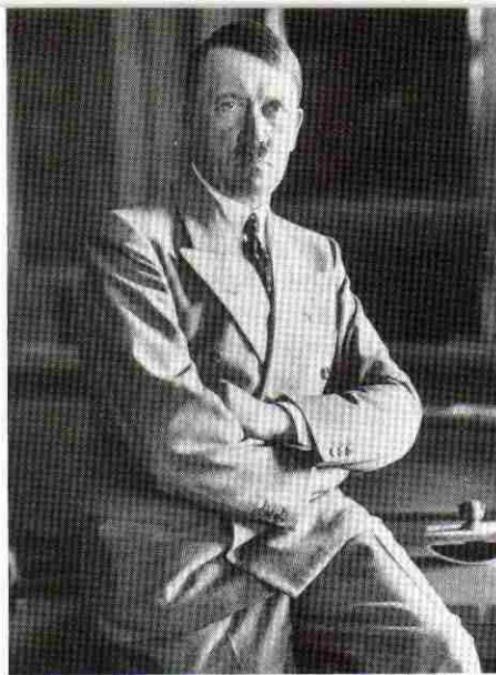
Hitler as 'bourgeois' — relaxing at his Alpine retreat Berchtesgaden.

Fourthly, in matters affecting established institutions and traditions, Hitler was seen as a 'moderate', opposed to the radical and extreme elements in the Movement. An obvious example is the 'church struggle'. Whenever fundamental institutions