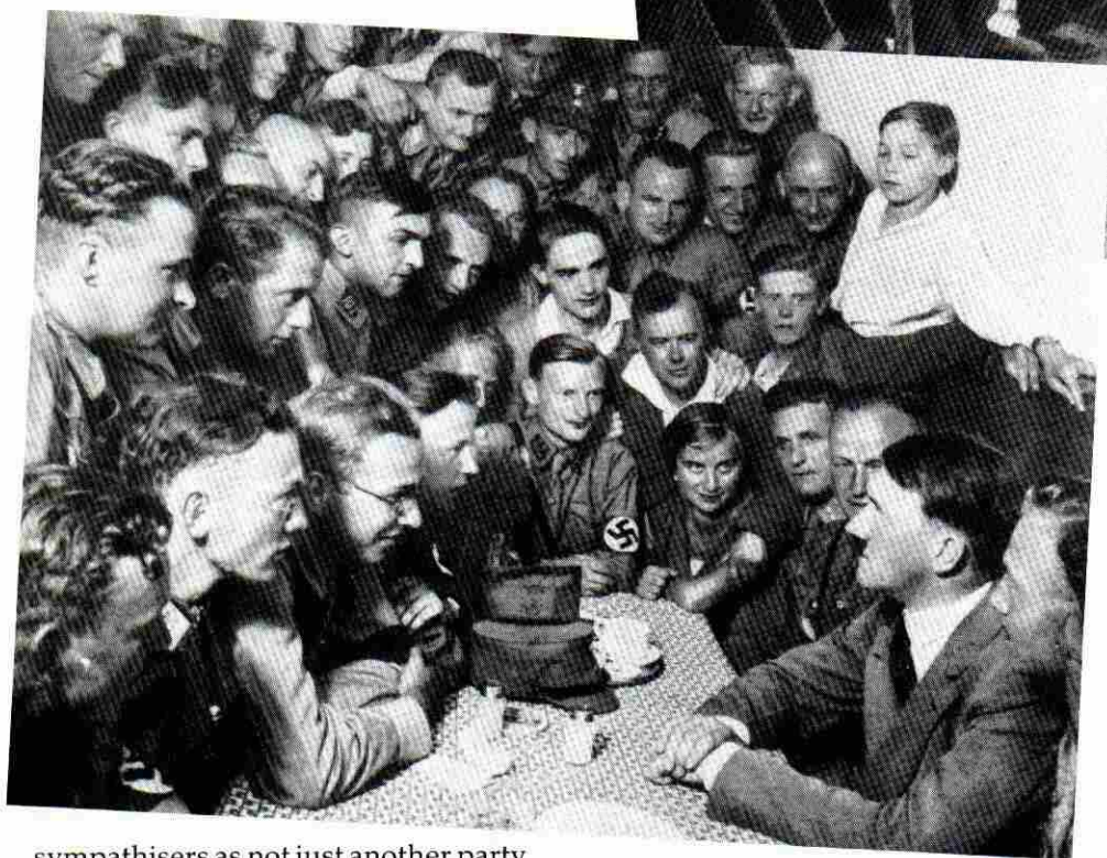
Hitler's ability to adopt a wide range of personas was a major asset in Nazi propaganda. (Clockwise) with young Nazis, 1933; meeting workers, 1934; sharing a joke with young children; the old Germany and the new — with President Hindenburg, 1933.

sympathisers as not just another party leader, but as the Leader for whom the nation had been waiting — a man of incomparably different stature to contemptible party politicians. The most important propaganda step now remained to be taken: the conversion, for the 'majority of the majority' that had still not supported Hitler in March 1933, of his image from that of leader of the Nazi Movement to that of national leader.