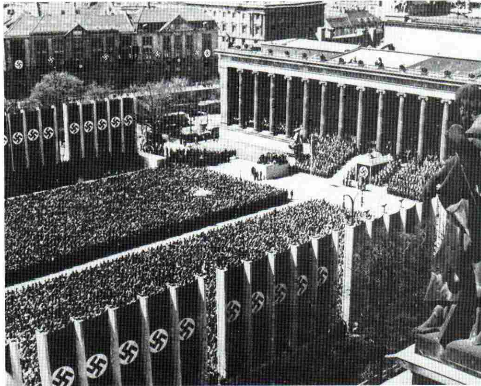
May rally in Berlin's Lustgarten, 1937, one of the set-piece occasions for Hitler's demagogery.

extension, as more and more Germans saw in Nazism – symbolised by its leader – the only hope for a way out of gathering crisis. Those now surging to join the Nazi party were often already willing victims of the 'Hitler Myth'. Not untypical was the new party member who wrote that after